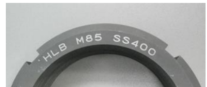
Mark of quality assurance